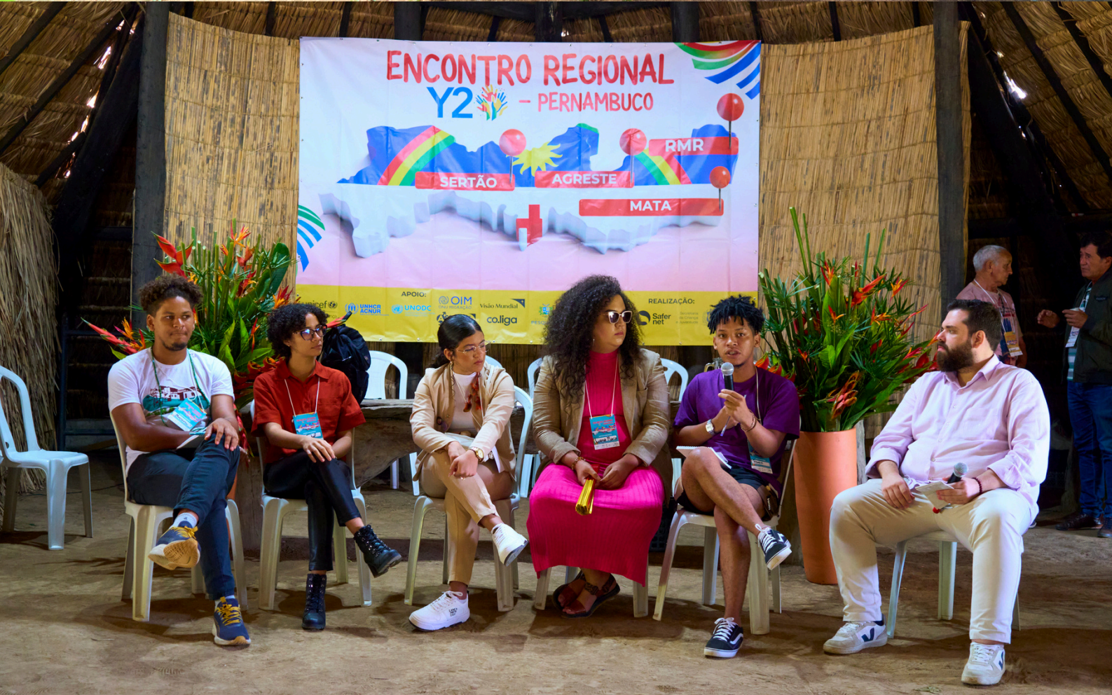
Y20 Regional Dialogue in the Pedra d'Água village, in the Xukuru do Ororubá indigenous territory, in Pesqueira (PE)