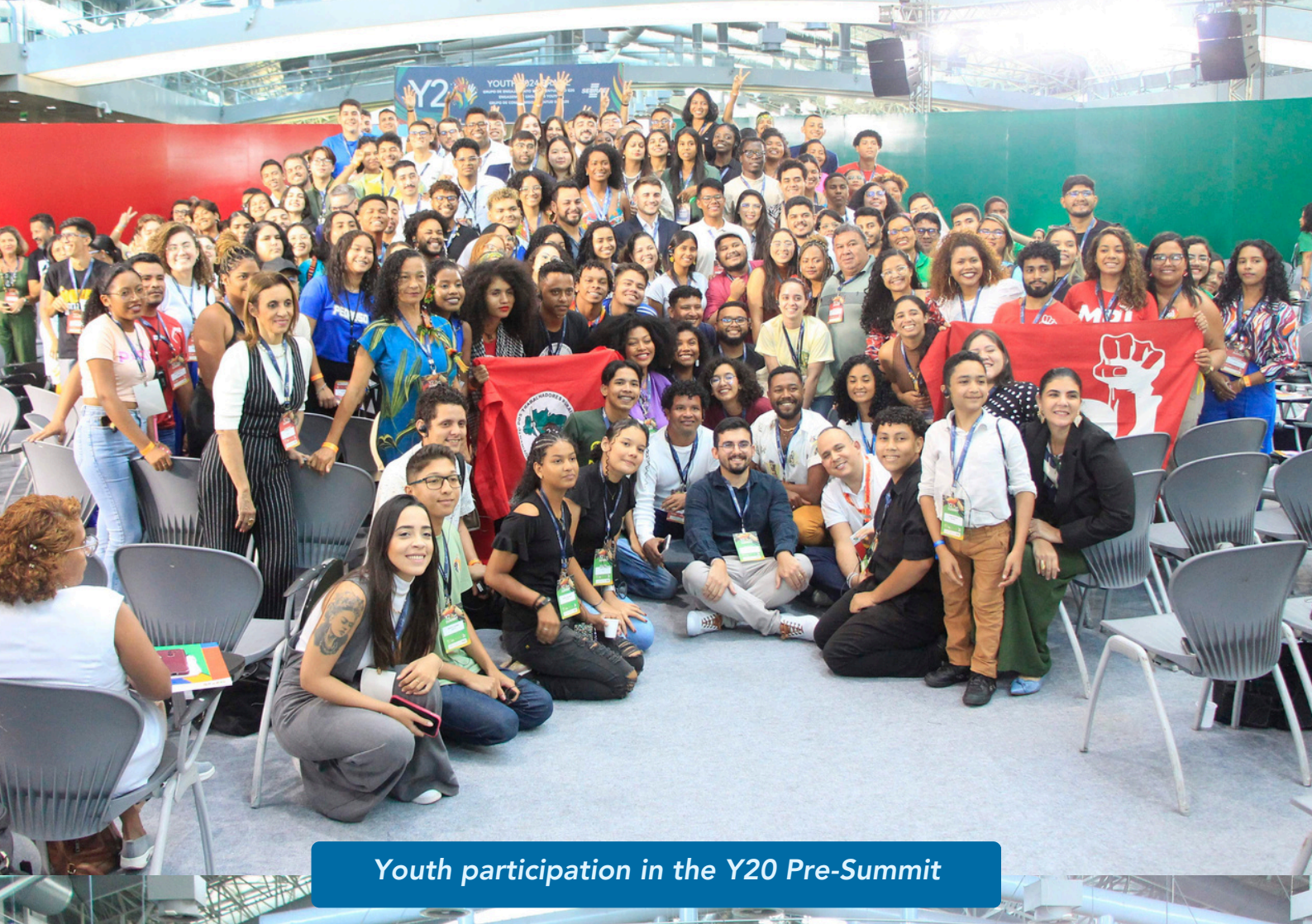
Youth participation in the Y20 Pre-Summit