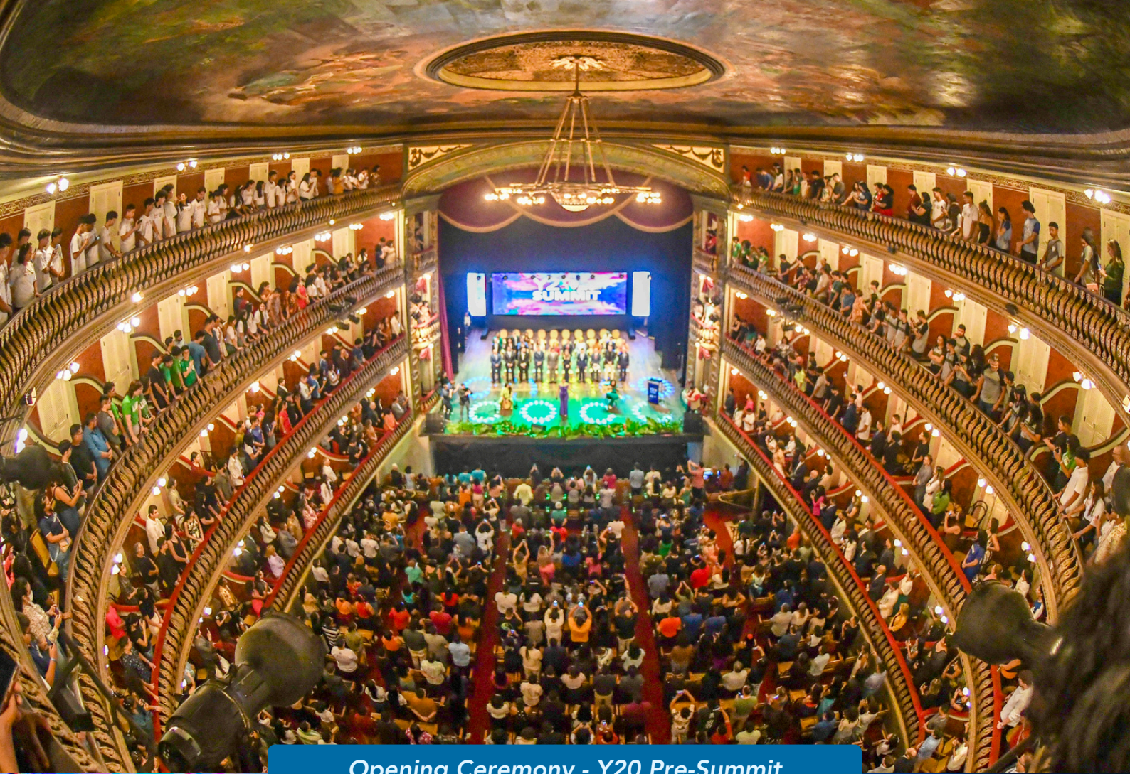
Opening Ceremony - Y20 Pre-Summit