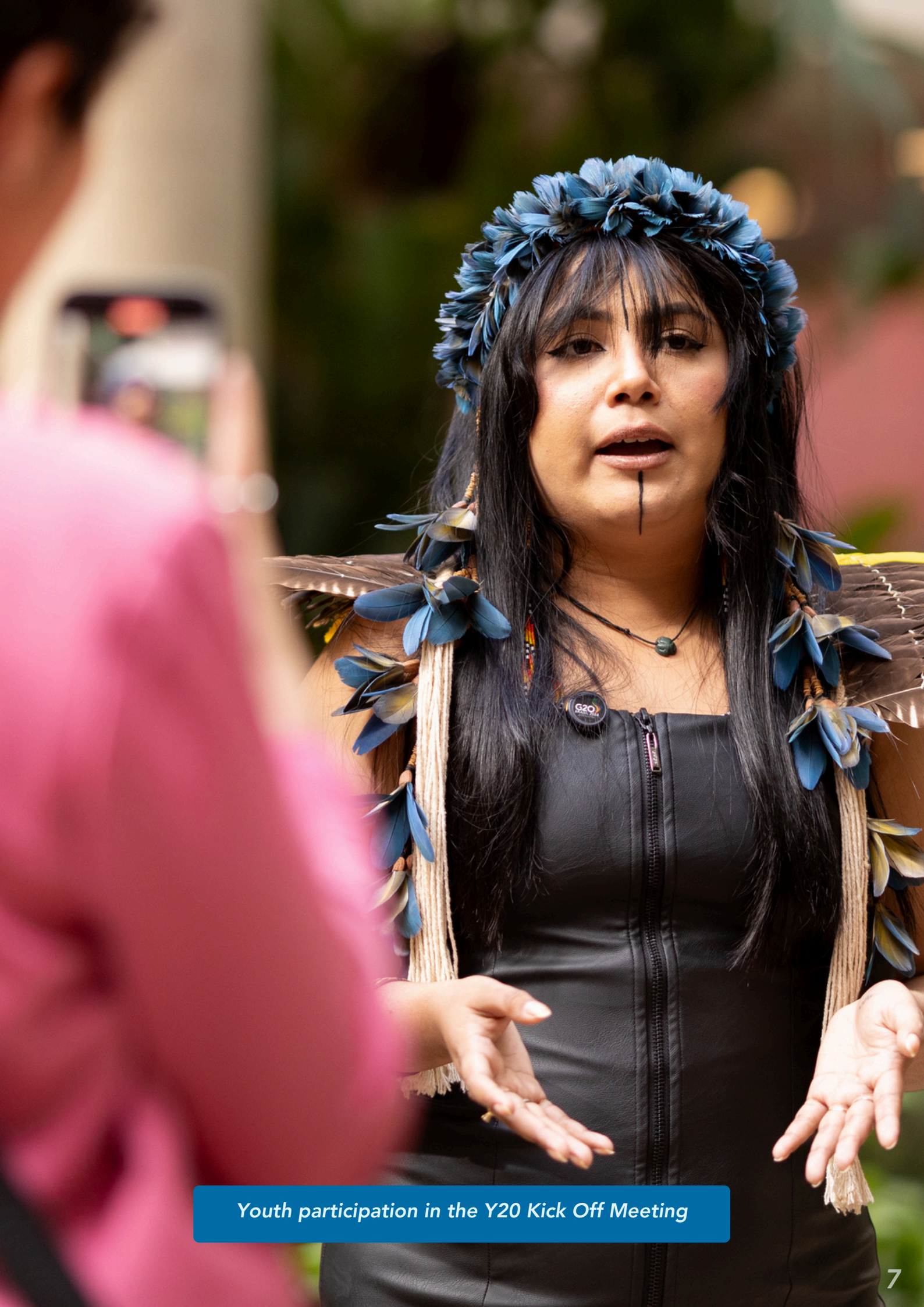
Youth participation in the Y20 Kick Off Meeting