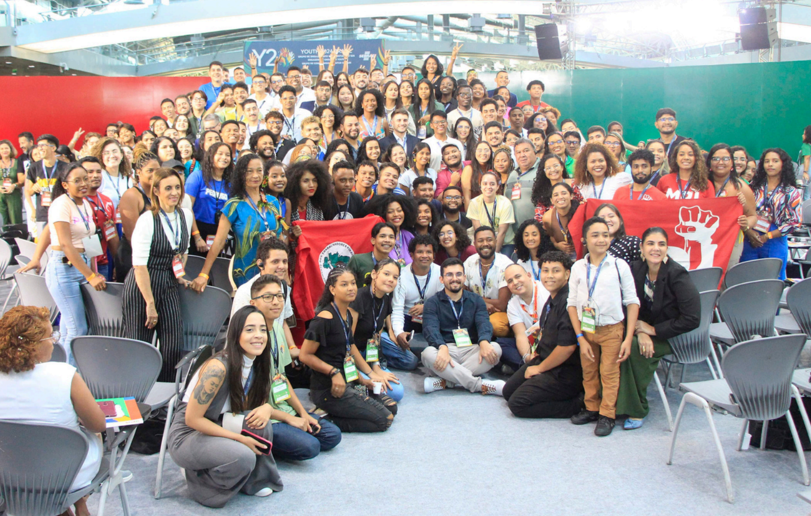
Youth participation in the Y20 Pre-Summit